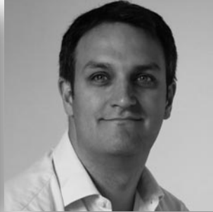
Mike Blanche Google